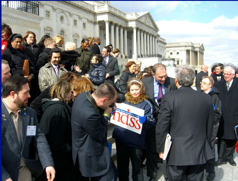
National Down Syndrome Society 2011 Buddy Walk on Washington