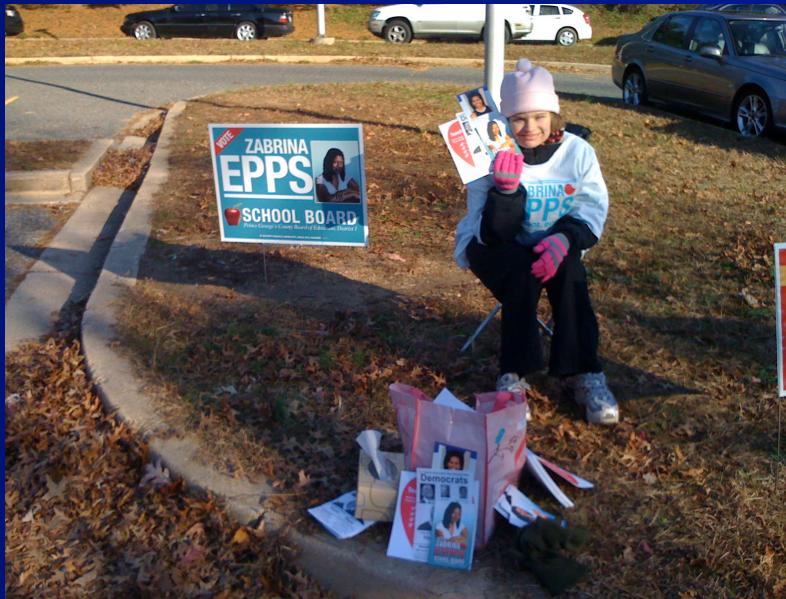
Board of Education 2012