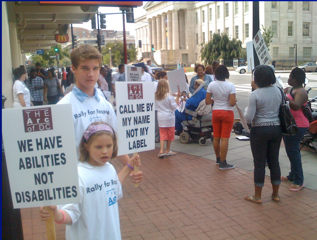
“Tropic Thunder” Protest 2008