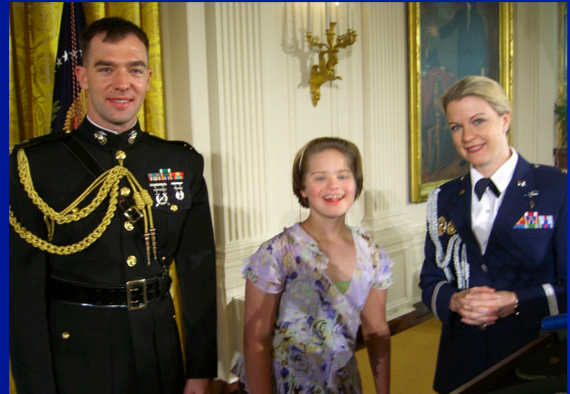
Federal bill celebration at White House