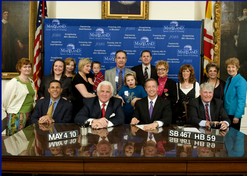
Maryland state bill signing